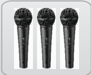
DM38PRO Microphone ( 3pcs )