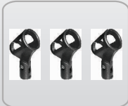
Mic stand adapter ( 3 pcs )